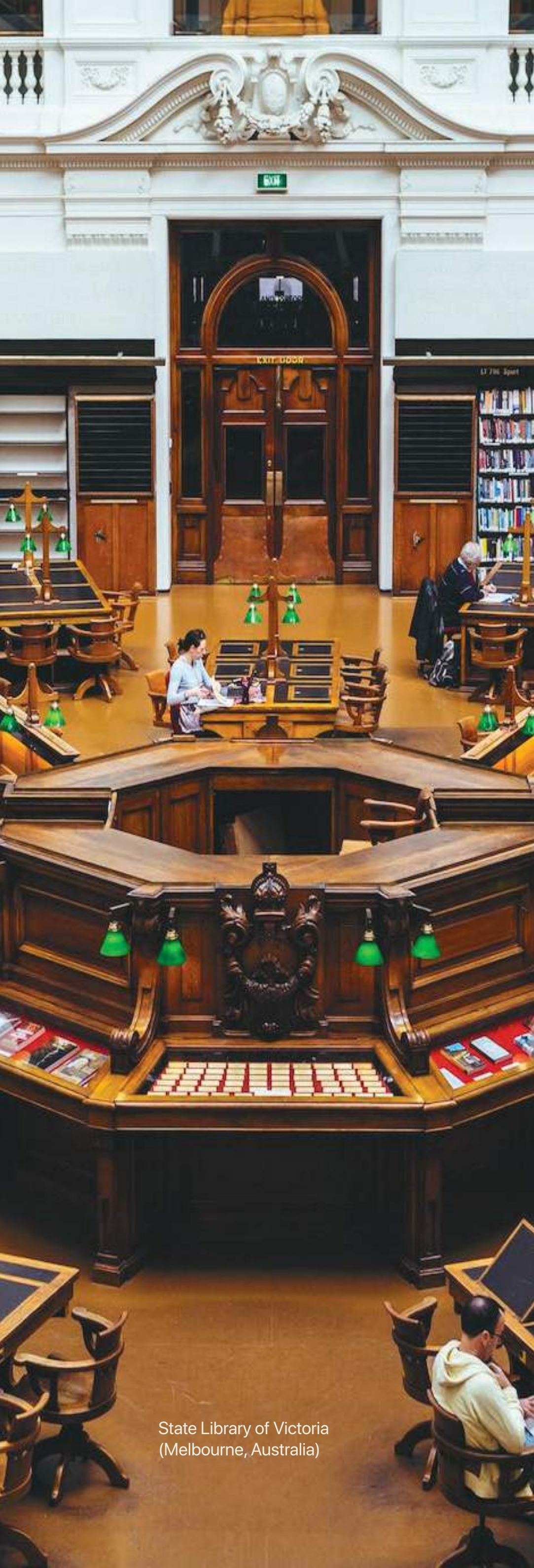
State Library of Victoria (Melbourne, Australia)